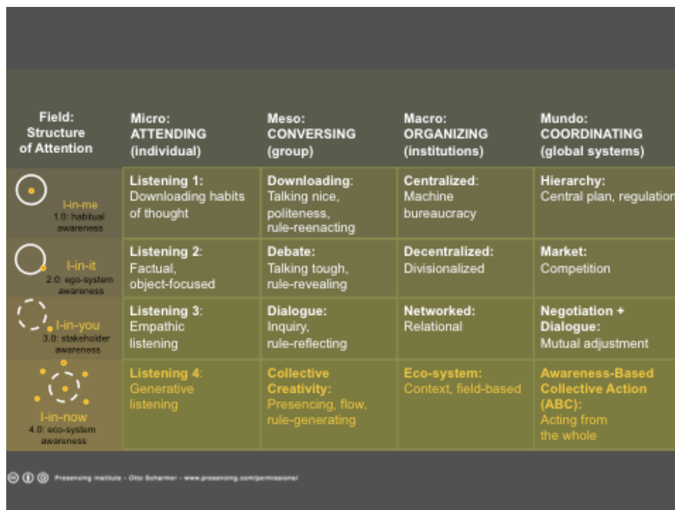
Fig. 2: Matrix of Social Evolution: Four Fields of Awareness; Four System Levels (Micro - Mundo)

The basic premise of Theory U is r = f(a_i) . The reality (r) that a system of players enacts is a function of the awareness (a) that these players operate from. Put differently: The quality of results in a system depends on the quality of relationships between the players in a system, and the quality of relationships depends on the quality of awareness that these players are operating from. Theory U is a social field theory that differentiates among four states of awareness (or “field structures of attention”) that individuals, groups, institutions, or larger systems can operate from. Those four states of awareness are: “I-in-me” (habitual awareness); “I-in-it” (egosystem awareness); “I-in-you” (relational system awareness); and “I-in-now” (ecosystem awareness) (see Figure 2).